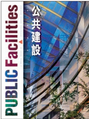
Cover design SIMON LI

Public Facilities is published jointly by the editorial teams of BUILDING JOURNAL and CONSTRUCTION & CONTRACT NEWS . All rights reserved. Reproduction in whole or in part without written permission is prohibited.