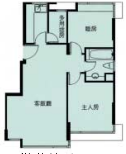
Alder block layout

Sanitary ware - Roca, Karat, Bellavista or equivalent