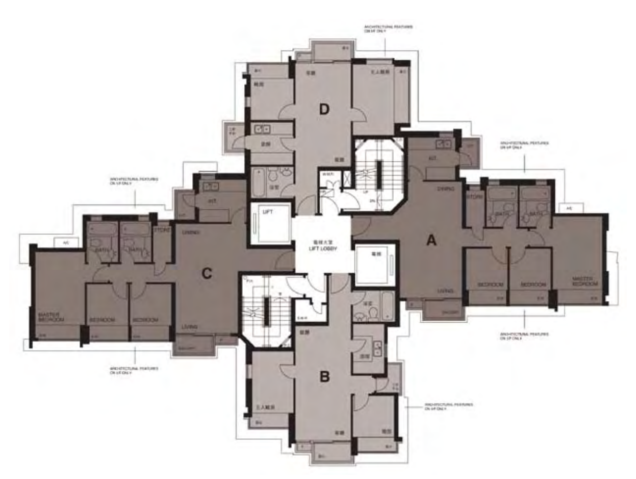
Tower 2 5-25/F floor plan