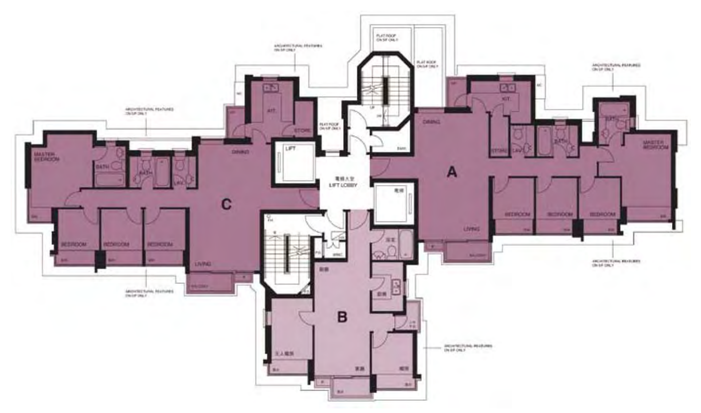
Tower 1 5-22/F floor plan