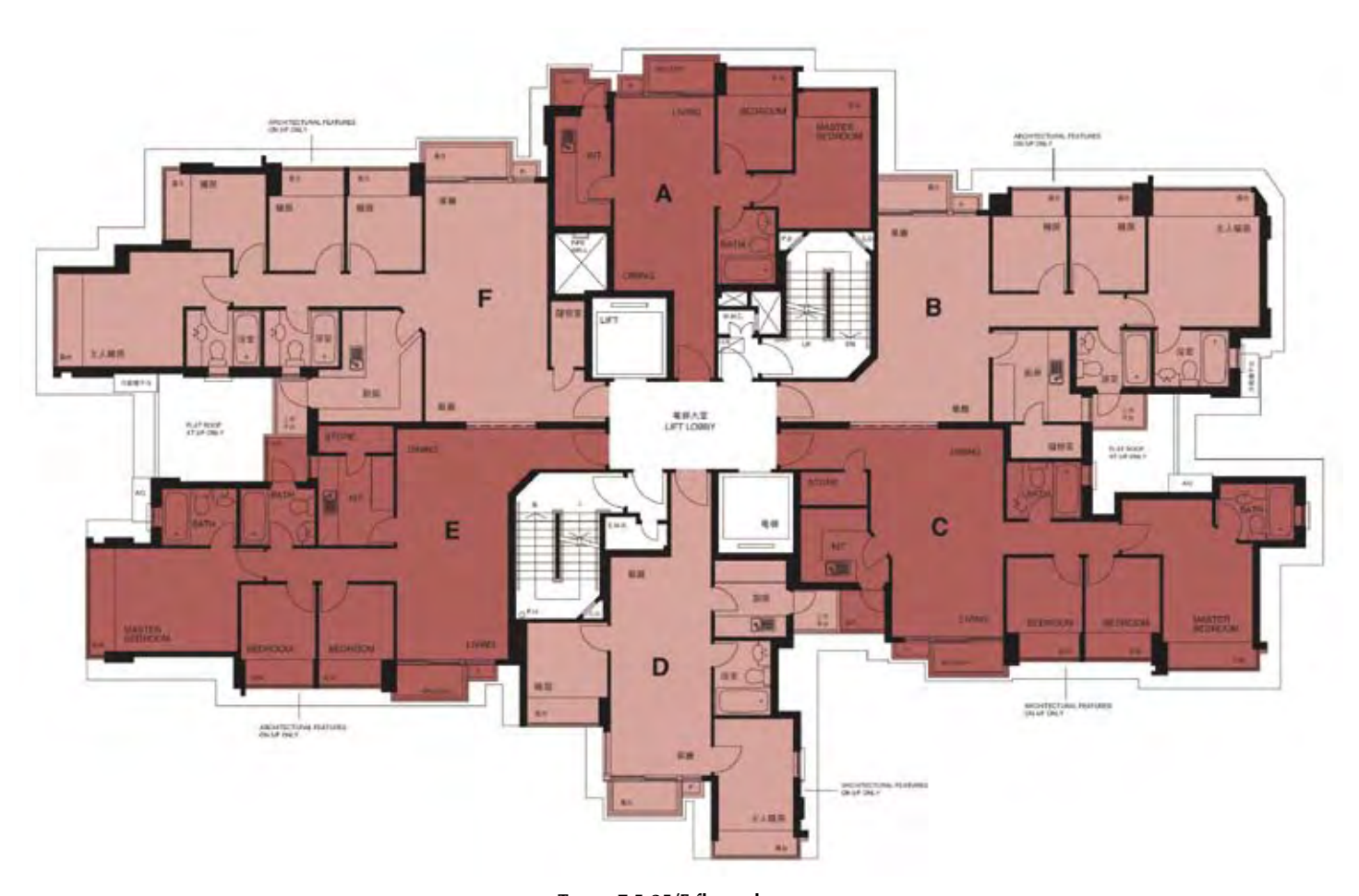
Tower 7 5-25/F floor plan