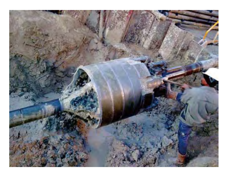
42" hole-opener successfully retrieved in 10 days

Sharing the project information with other TT Group offices in the USA and Germany, TT-