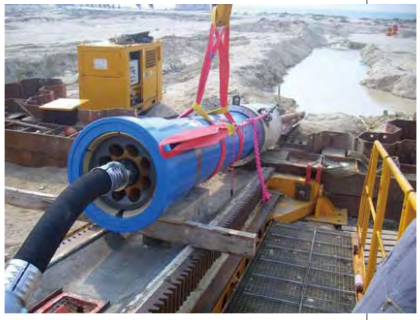
250T HDD Machine

This rescue saved significant financial implications such as the total cost of a lost drilled bore. Any contractual penalties. Any ongoing cost delays in commissioning the final pipelines All associated costs involved in planning a new bore and the actual costs of duplicating all the undertakings of a new bore/installation, etc.