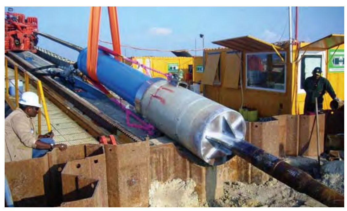
Taurus (600 mm) Grundoram Hammer with 2,000 Nm Impact Energy