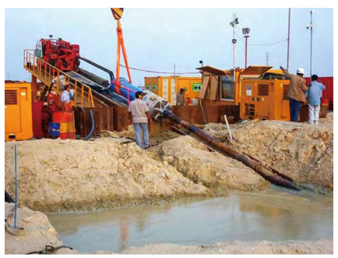
Grundoram Taurus Ramming