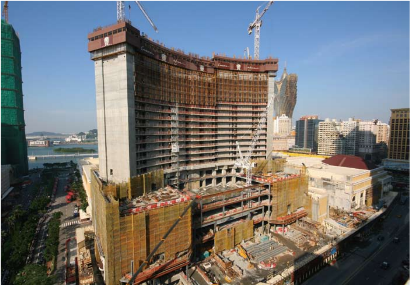
Wynn Encore, Macau