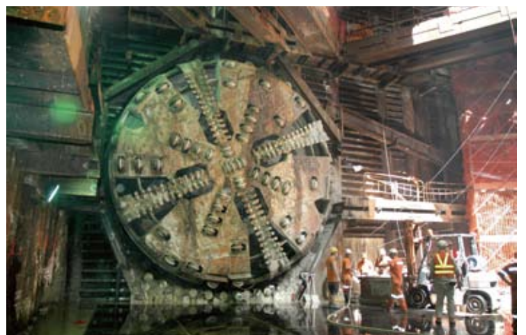
Tunnel boring machine at Kowloon Southern Link