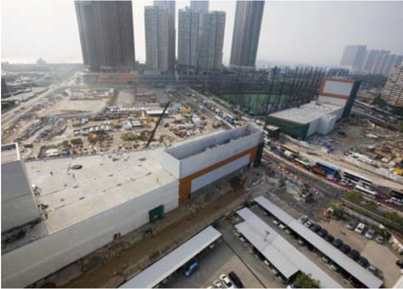
Kowloon Southern Link, Hong Kong