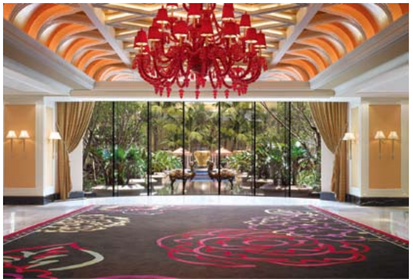
Wynn Resorts, Macau